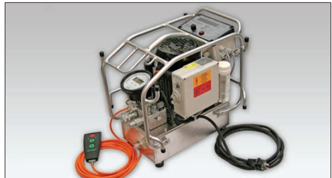
JETSTREAM 115/230 TORQUE & ANGLE